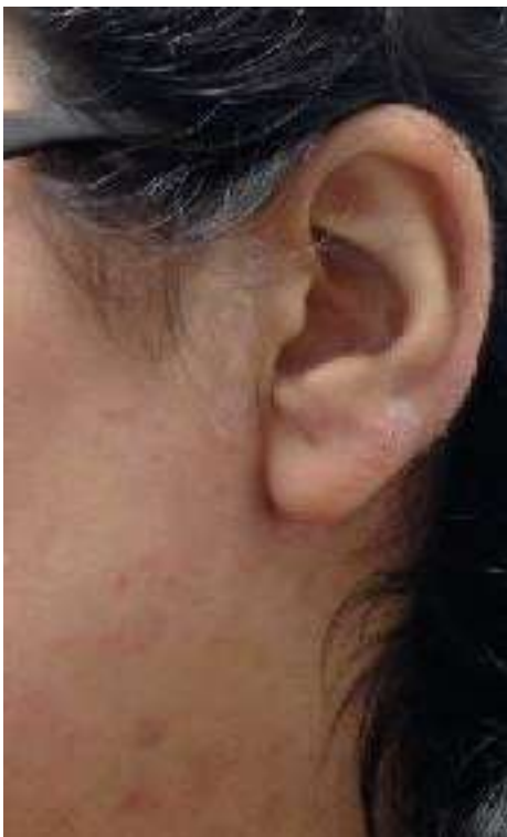
Before Using DermaZor – Week 0