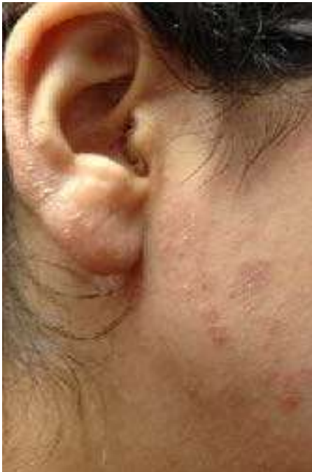
Before Using DermaZor – Week 0